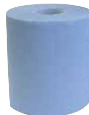
50505-48 Sub-Micronic Cartridge Option