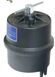
50500-12 Sub-Micronic Air Filter Option