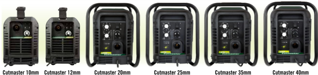
Cutmaster True Series Unit Specifications*

*Not available on the Cutmaster 10 & 12mm